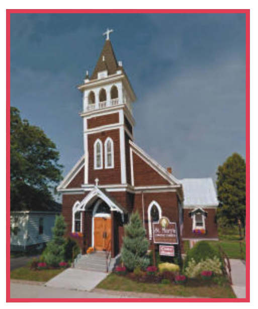
St. Mary's NYS Rt. 12, Copenhagen Land Deeded 1901, Incorporated 1890 Present Church Dedicated 1902

We are two diverse communities of faith who are united in bringing the Gospel into the daily lives of all who worship with us. We stand together with all people, especially the poor and the alienated, as a sign of God's universal love for all people. We extend a warm welcome to all and hope that you will find the parishes of St. James and St. Mary's places where faith can be nourished.