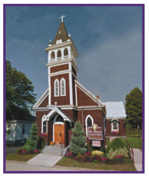
St. Mary's NYS Rt. 12, Copenhagen Land Deeded 1901, Incorporated 1890 Present Church Dedicated 1902

We are two diverse communities of faith who are united in bringing the Gospel into the daily lives of all who worship with us. We stand together with all people, especially the poor and the alienated, as a sign of God's universal love for all people. We extend a warm welcome to all and hope that you will find the parishes of St. James and St. Mary's places where faith can be nourished.