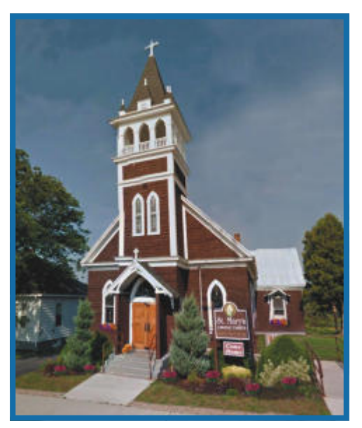
St. Mary's NYS Rt. 12, Copenhagen Land Deeded 1901, Incorporated 1890 Present Church Dedicated 1902

We are two diverse communities of faith who are united in bringing the Gospel into the daily lives of all who worship with us. We stand together with all people, especially the poor and the alienated, as a sign of God's universal love for all people. We extend a warm welcome to all and hope that you will find the parishes of St. James and St. Mary's places where faith can be nourished.