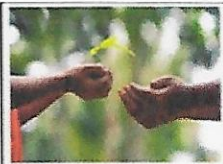
Care of Creation rcdony.org/about-us/care-of-creation.html