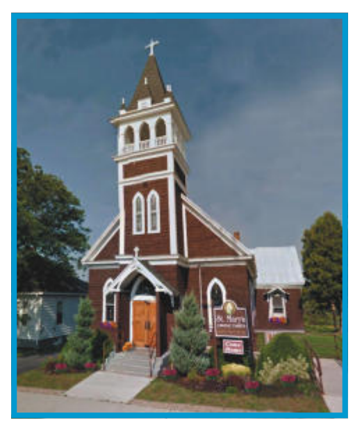
St. Mary's NYS Rt. 12, Copenhagen Land Deeded 1901, Incorporated 1890 Present Church Dedicated 1902

We are two diverse communities of faith who are united in bringing the Gospel into the daily lives of all who worship with us. We stand together with all people, especially the poor and the alienated, as a sign of God's universal love for all people. We extend a warm welcome to all and hope that you will find the parishes of St. James and St. Mary's places where faith can be nourished.