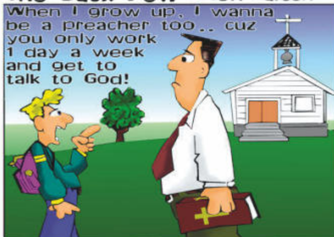
Reverend Jacobs was both flattered and exasperated when Billy picked him to interview for career day.