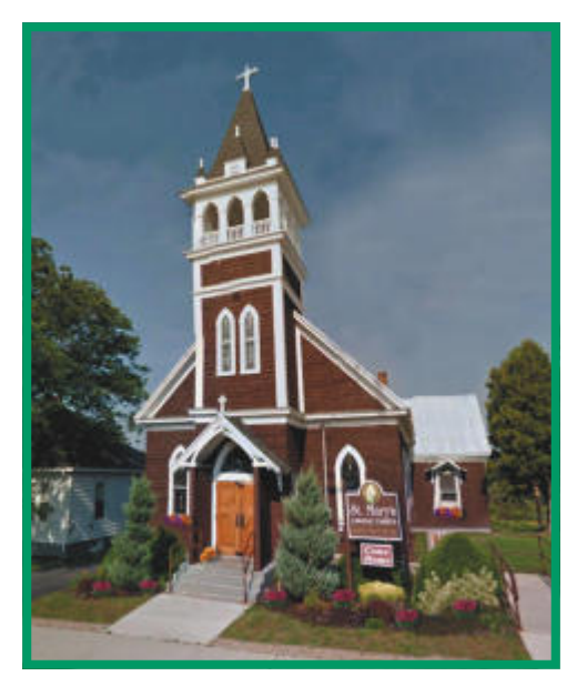
St. Mary's NYS Rt. 12, Copenhagen Land Deeded 1901, Incorporated 1890 Present Church Dedicated 1902

We are two diverse communities of faith who are united in bringing the Gospel into the daily lives of all who worship with us. We stand together with all people, especially the poor and the alienated, as a sign of God's universal love for all people. We extend a warm welcome to all and hope that you will find the parishes of St. James and St. Mary's places where faith can be nourished.