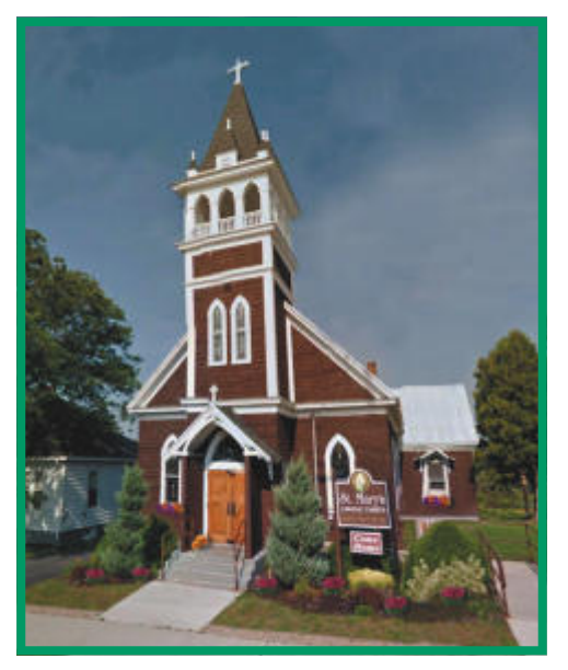
St. Mary's NYS Rt. 12, Copenhagen Land Deeded 1901, Incorporated 1890 Present Church Dedicated 1902

We are two diverse communities of faith who are united in bringing the Gospel into the daily lives of all who worship with us. We stand together with all people, especially the poor and the alienated, as a sign of God's universal love for all people. We extend a warm welcome to all and hope that you will find the parishes of St. James and St. Mary's places where faith can be nourished.